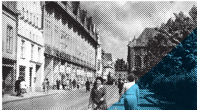
Wertheim Department Store